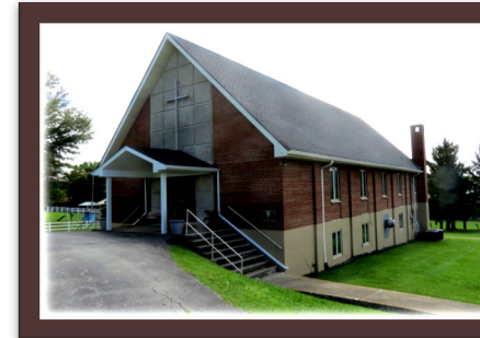
Good Shepherd 1217 Greensburg Street Columbia