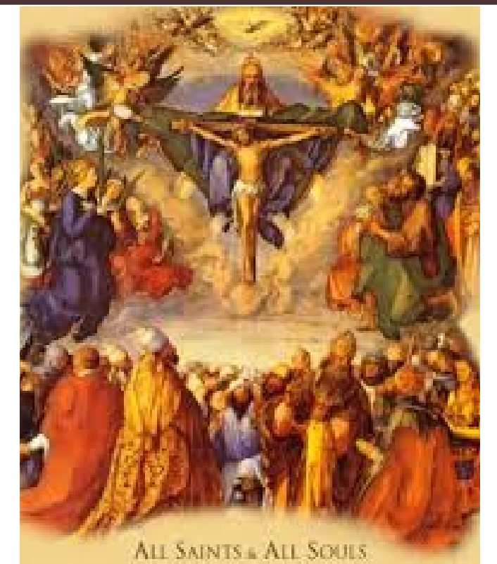
ALL SAINTS & ALL SOULS